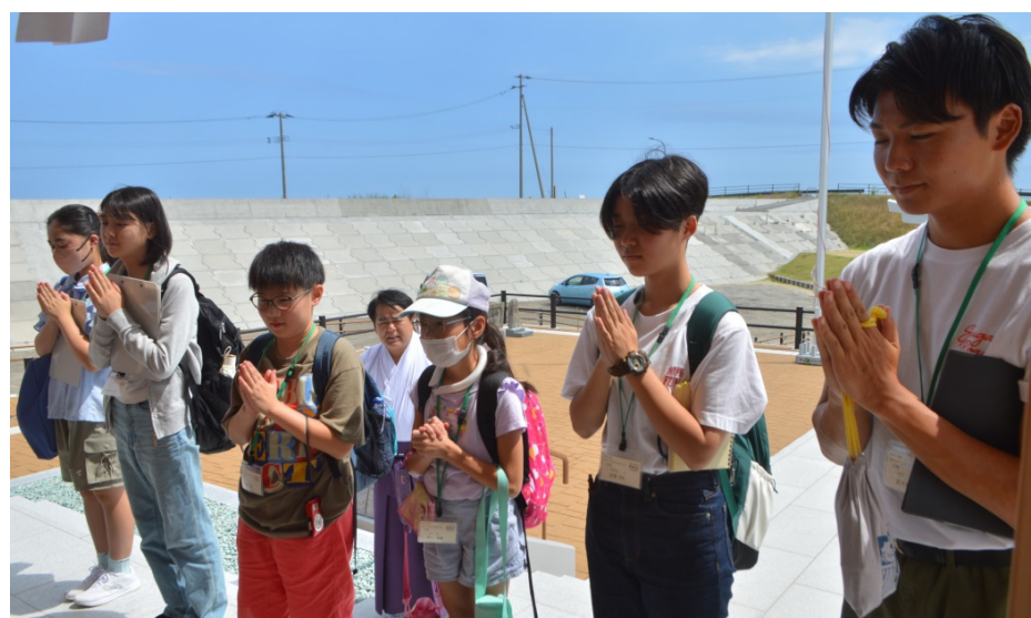
Visiting Kusano Shrine, rebuilt after being swept away by the tsunami, and praying for the souls of the victims