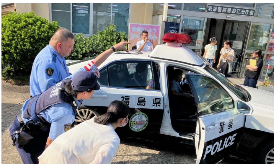
Exploring the Ultra Police Squad patrol car to deepen their understanding