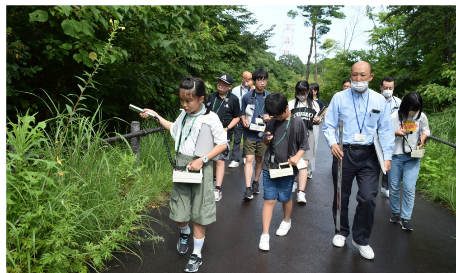
Measuring radiation levels at the monitoring field inside Reprun Fukushima