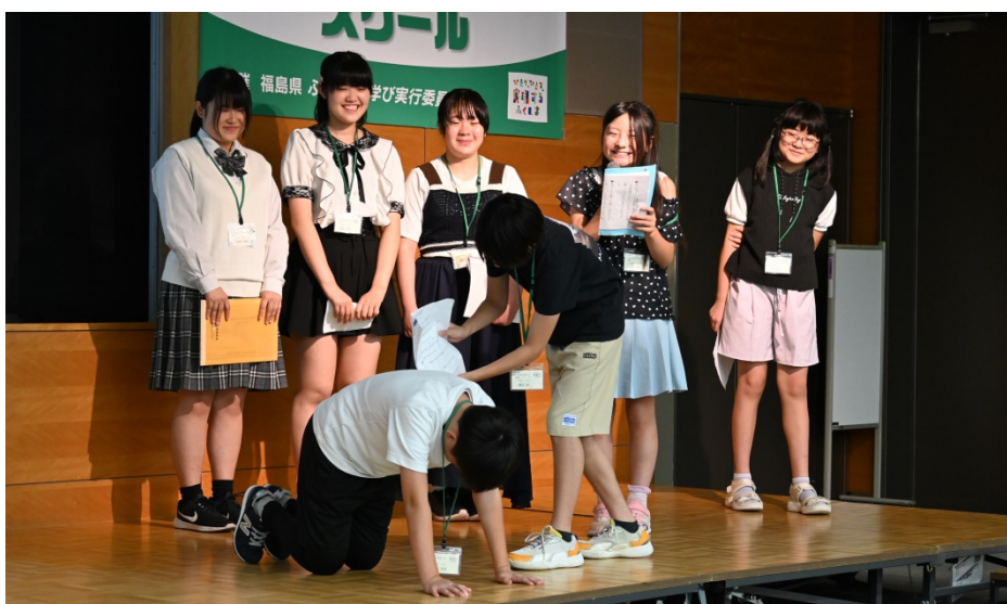
A unique presentation using body movements to share what they learned from their interviews