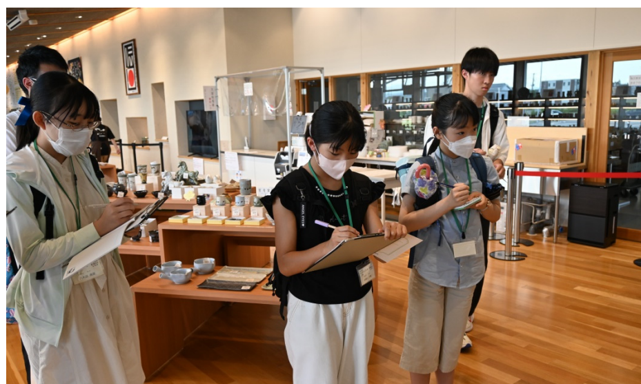
Interviewing about Obori Soma ware, taking notes with great focus