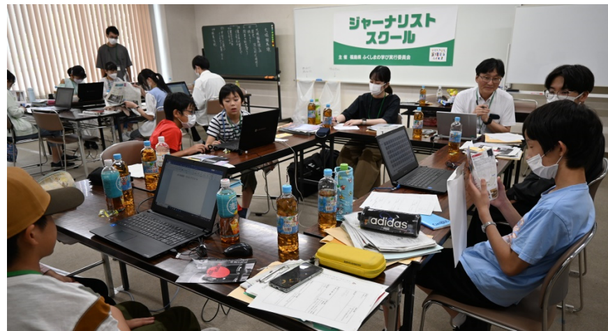
Students brainstorming article content with guidance from their advisor

Amid ongoing recovery efforts from the Great East Japan Earthquake and the Fukushima Daiichi Nuclear Power Station accident, students participated in a four-day journalism school, determined to share the current state of Fukushima’s journey toward revitalization. Through interviews with people working on revitalization efforts, they felt a strong surge of passion and energy. With the resolve that “it’s up to our younger generation to carry the message forward,” they deepened their understanding of how to convey stories effectively, learning about the mindset of a journalist, article writing, and newspaper editing.