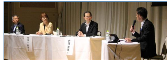
(The Panel Discussion)