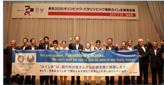
(At the end of the meeting, the Council unveiled a banner bearing a message of thanks to the world)