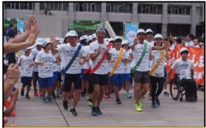
(Amateur runners, Olympians, and Paralympians line up for the relay at the Prefectural Government Offices)

This relay race from Aomori to Tokyo has been held every year since 2013 with the aim of lifting the spirits of people in areas affected by the 3.11 earth-quake. From this year the race has been designated a Tokyo 2020 Official Programme. The race was held from July 31 to August 4, during which time numerous amateur runners, Olympians and Paralympians raced through Fukushima, giving inspiration to the people of the prefecture, who are working hard towards recovery in preparation for Tokyo 2020.