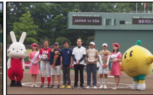
(Photo: Ceremony before the competition) ※Front row, 5 th from left: Mayor Kohata, 6 th from left: Governor Uchibori