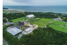
The Grand Start from J Village

The Tokyo Olympic and Paralympic Committee has announced the outline of the Olympic torch relay route. Starting on June 1st in Fukushima Prefecture's J Village (Hirono · Naraha), the relay will pass through a total of 25 municipalities, towns, and villages within Hamadori, Nakadori, and Aizu. Kicking off on March 26th 2020, the torch relay will take place over three days. When the torch reaches its final destination each day, there will be a celebration ceremony.