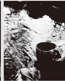
Fukushima is an "onsen" (hot spring) kingdom.