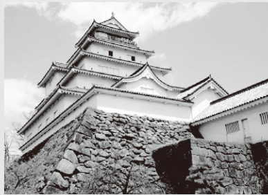
Aizu-Wakamatsu, which used to be a castle town during the Edo Period (1603-1867)